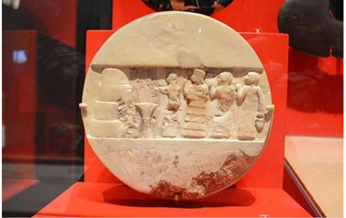
Fig.7 Disk of Enheduanna

in all heaven and earth you are the form-shaping place spreading fear like a great poisonous snake O Lady of the Mountains Ninhursag's house built on a terrifying site O Kesh like holy Aratta inside is a womb dark and deep your outside towers over all imposing one great lion of the wildlands stalking the high plains great mountain incantations fixed you in place inside the light is dim even moonlight (Nanna's light) does not enter only Nintur Lady Birth makes it beautiful O house of Kesh the brick of birthgiving your temple tower adorned with a lapis lazuli crown your princess Princess of Silence unfailing great Lady of Heaven when she speaks heaven shakes open-mouthed she roars Aruru sister of Enlil O house of Kesh has built this house on your radiant site and placed her seat upon your dais