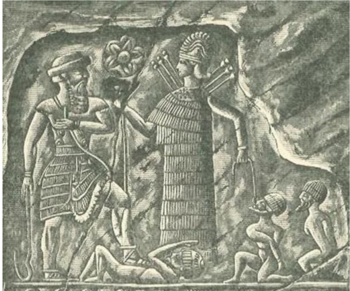
Fig.8 Inanna and Ishtar presenting prisoners of war

Dumuzi master of the Emush O Badtibira (fortress of the coppersmith) has built this house on your radiant site and placed his seat upon your dais