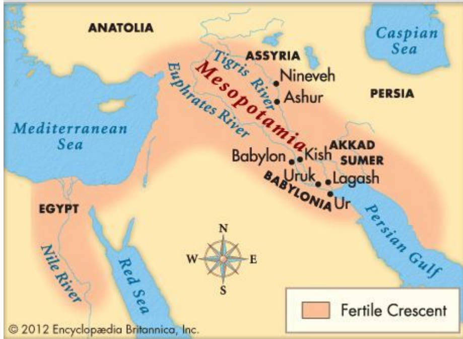
Fig. 2 Map of the Fertile Crescent