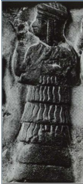
Fig.3 Stone carving depicting Enheduanna