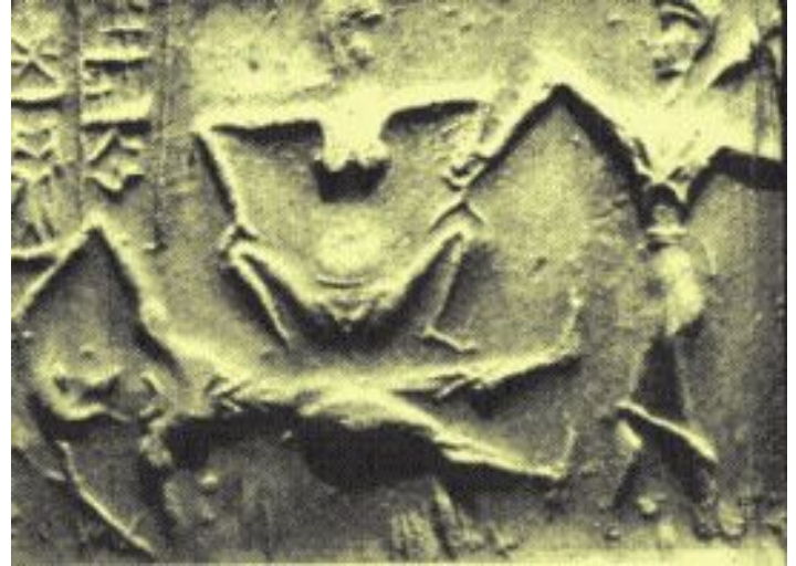
Fig. 10 Ereshkigal gives birth, Inanna and Dumuzi look on

Lady of all divine powers, Lady of the all-resplendent light, Righteous Lady clothed in heavenly radiance, Beloved Lady of An and Uraš, Mistress of heaven with the holy diadem, Who loves the beautiful headdress befitting the office of her high priestess, Powerful Mistress who has seized all seven divine powers, My lady, you are the guardian of the seven divine powers! You have seized the divine powers, You hold the divine powers in your hand, You have gathered up the divine powers, You have clasped the divine powers to your breast! Like a dragon you have spewed venom on foreign lands that know you not! When you roar like Iškur at the earth, nothing can withstand you! Like a flood descending on alien lands, O Powerful One of heaven and earth, you will teach them to fear Inanna!