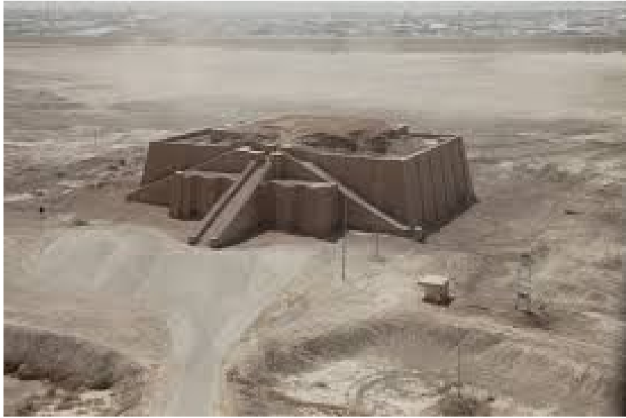
Fig5 Ziggurat of Ur