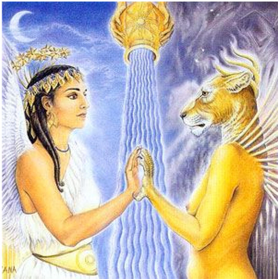
Fig.9 Inanna and Ereshkigal

divine Nanshe mighty Lady O house of Sirara has built this house on your radiant site and placed her seat upon your dais