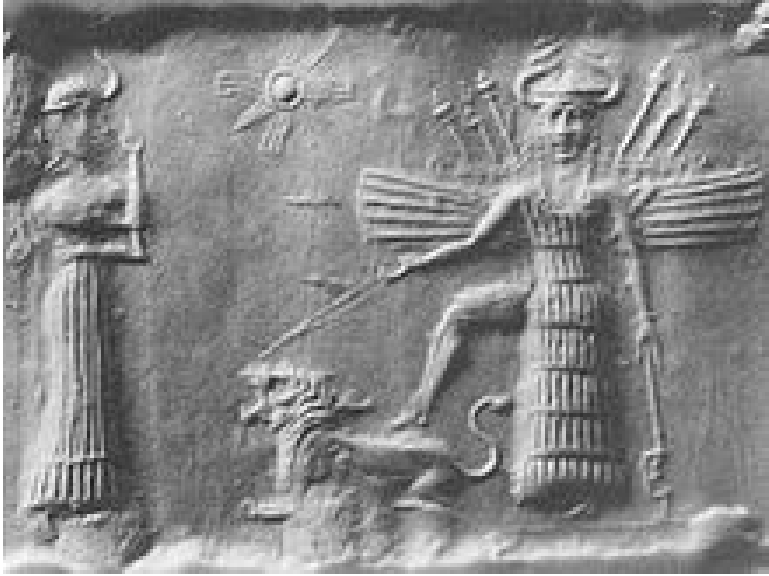
Fig. 1 Seal depicting Inanna, resting her foot on the back of a lion.